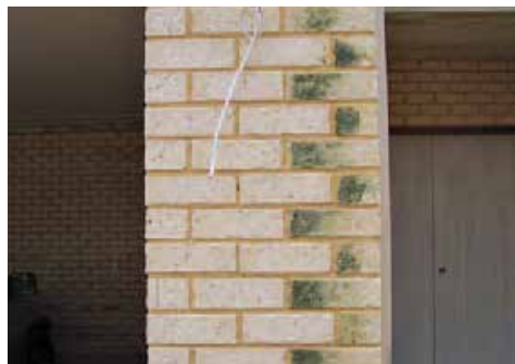
Vanadium as a green stain on light coloured bricks

This is probably the best known chemical for removal of vanadium stains. However if used it must be followed by a neutralising wash. This action is commonly omitted