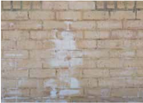
Efflorescence as seen on brick faces

Persistent efflorescence may be a warning that water is entering the wall through faulty copings, flashings or pipes.