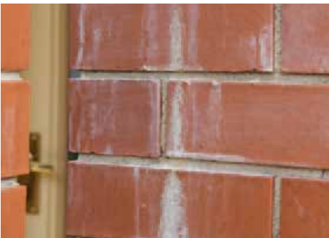
Calcium stains leaching from adjacent concrete balcony