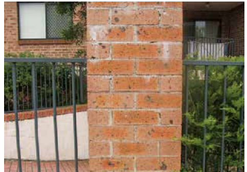
Acid burn on face brick work

Pre-wetting and frequent washing off is designed to prevent undue penetration of the acid into the brick and mortar where further reactions and staining often occur. Window sills and corners require particular attention with pre-wetting as the water readily runs off instead of being absorbed.