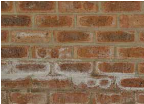
Efflorescence from ground salts