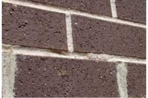
Damage to ironed mortar joint