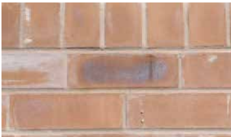
Signs of manganese staining