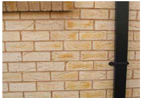
Acid burn on light coloured bricks