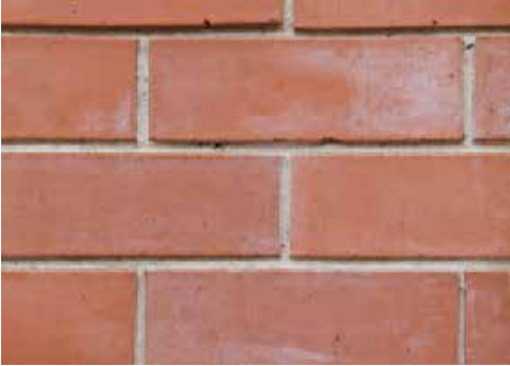
Typical calcium stain from wet sponging mortar joints